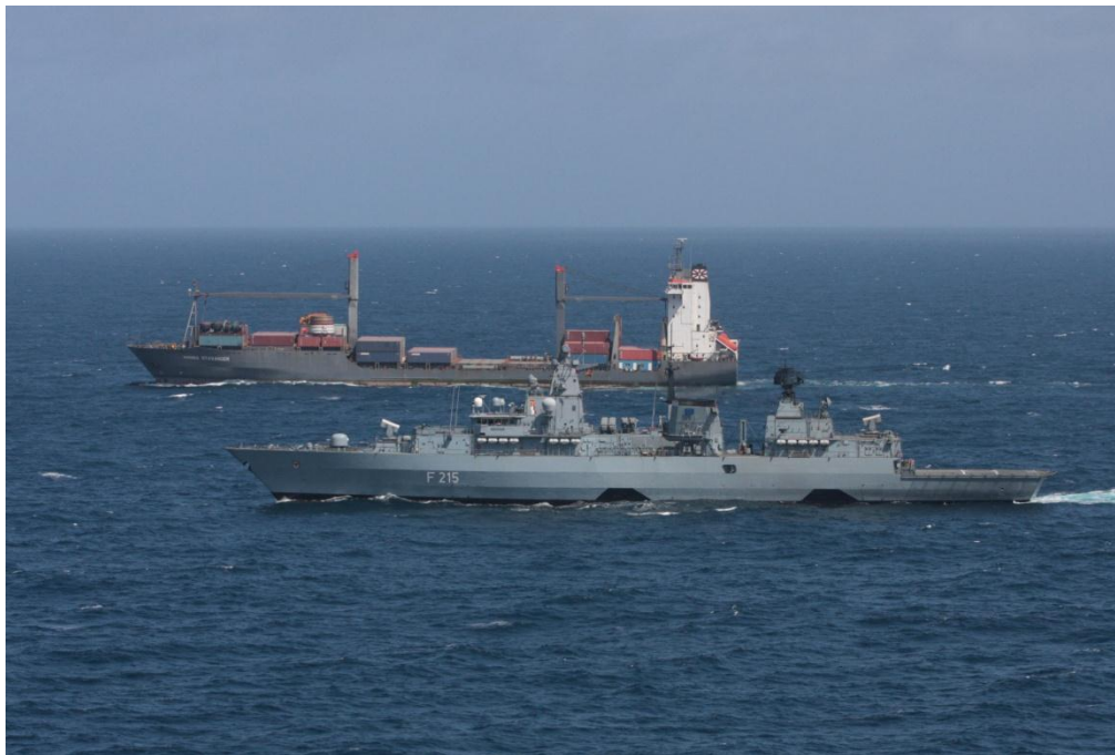
Protect vulnerable shipping